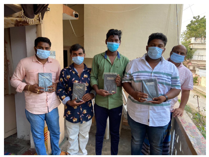
New Bibles to new KRPTS students

International Bible Academe. We are still seeking to replace some lost support for the "India Evangelism" work of T.V. Samson Raj in Hyderabad. I have been designing a web page for the purpose, and contacting churches. Brother Samson serves three churches (all of which he planted) ranging in size