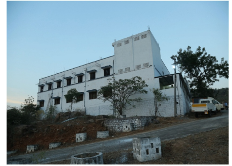
Scenic Hill meeting house