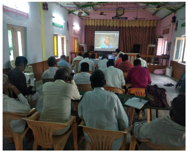
KRPTS during our Skype class

The September 29 Skype class for Krishna River Preacher-Training School was a study of II Peter 1:1-11. The October 20 class was on the subject of circumcision. Some in India have been preaching the necessity of keeping that practice as a law of God even in the church today. The students had requested a study of the truth. Response to the class was overwhelming gratitude from students and instructors alike. There were also several area gospel preachers in attendance looking for helping in challenging the false teachers. They also expressed thanks for the help.