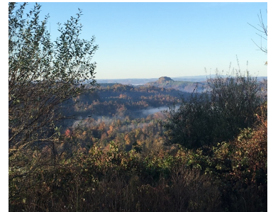
View from our Virginia campground